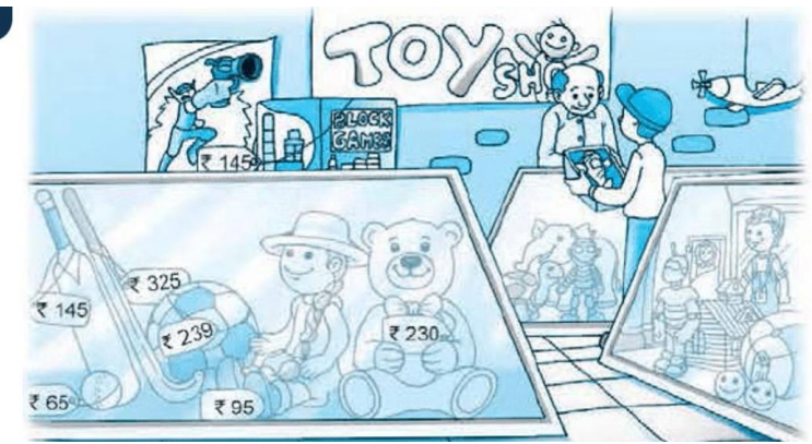
Page 3 of 6