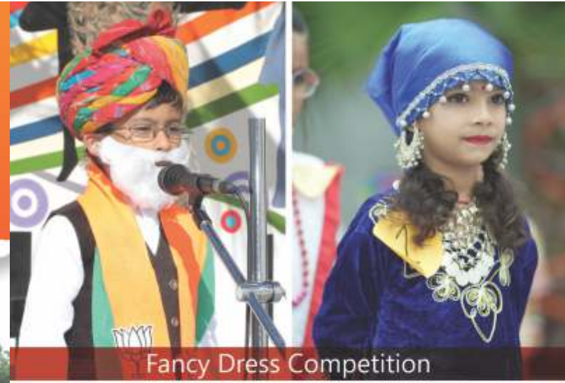
Fancy Dress Competition