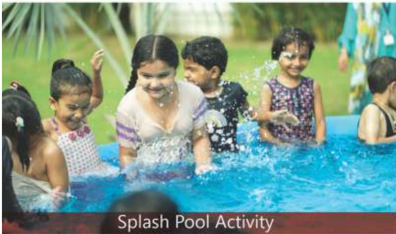
Splash Pool Activity