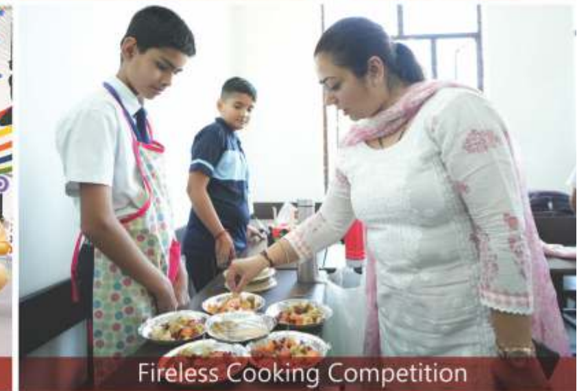
Fireless Cooking Competition