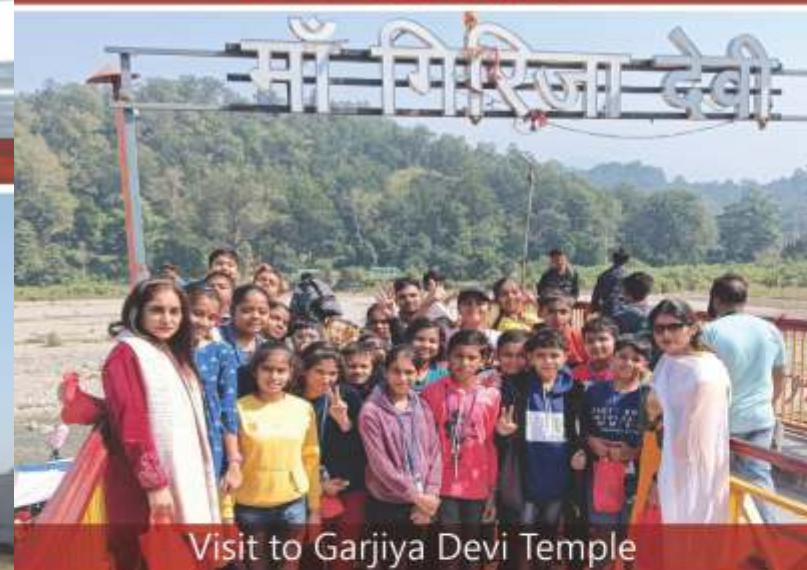
Visit to Garjiya Devi Temple