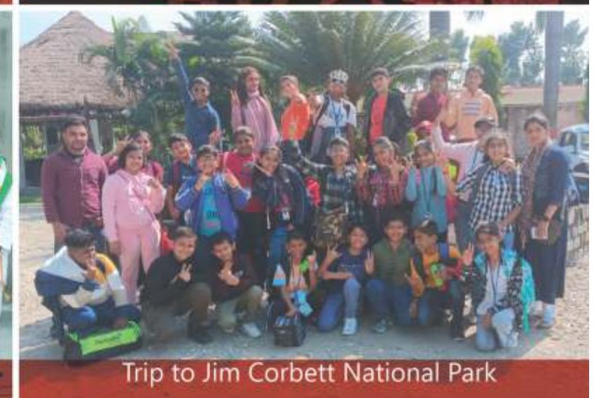
Trip to Jim Corbett National Park