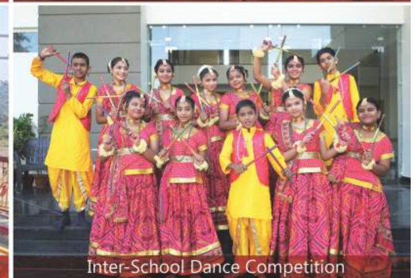
Inter-School Dance Competition